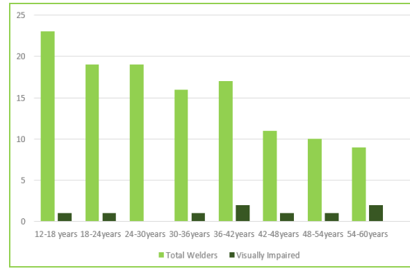
Figure-1: Age group mostly affected

Working experience of tailors ranged from 1–2 years up to more than 35 years. Majority of tailors had working experience of 5–15 years with a mean of 12.72 years with +SD8.25 years.